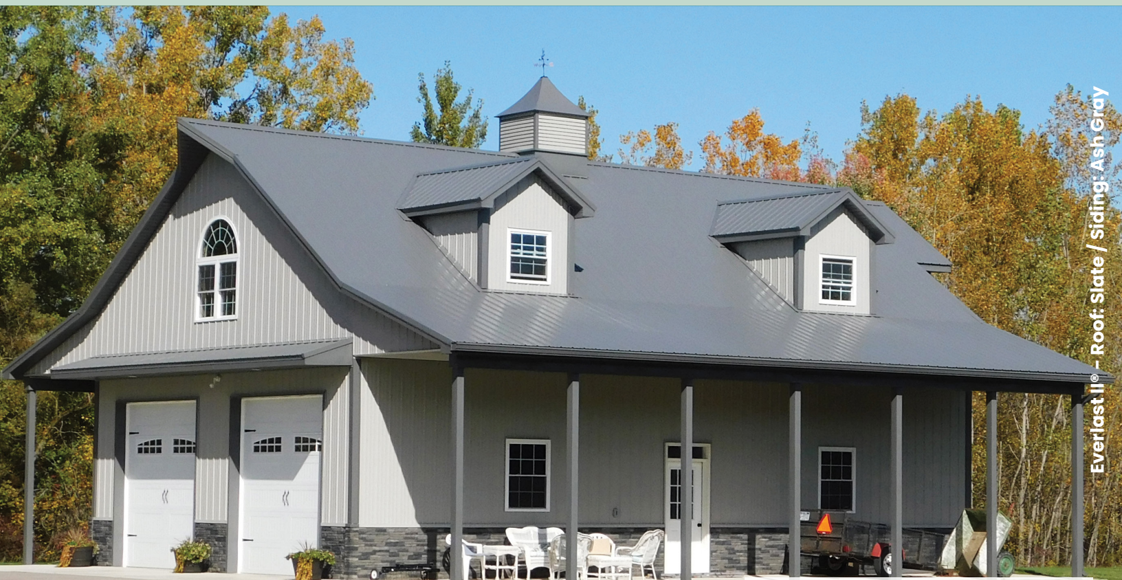
Everlast II® - Roof: Slate / Siding: Ash Gray